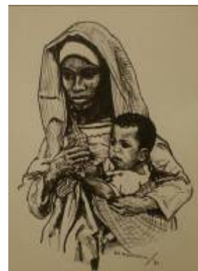
Thonga Mother and Child

They are available by emailing hfzvp@wamail.net or calling 253.759.9904.