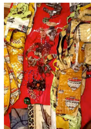
Colorful items from the Tetekela Women's Club!