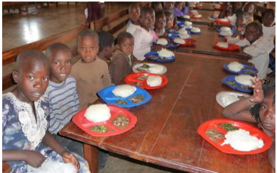
The children enjoying their daily meal of maize, dried fish, and greens made possible by your generosity.